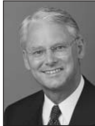
GORDON CAMPBELL, MLA Vancouver Point Grey

Best wishes for a successful 2004-2005 school year.